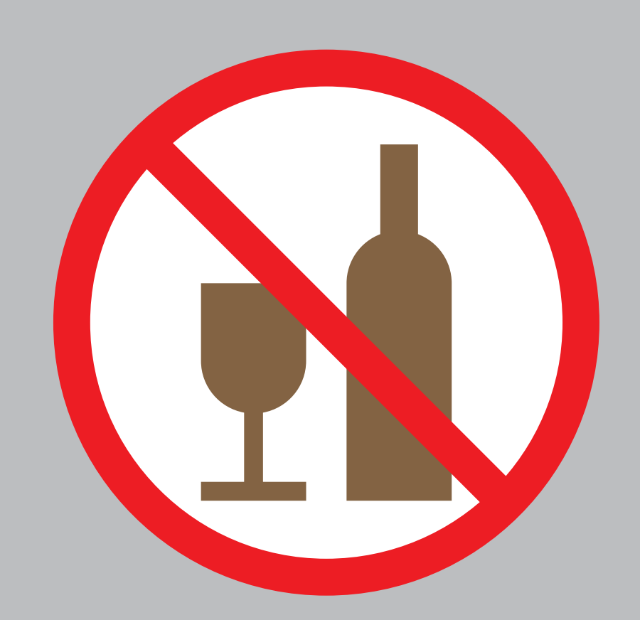
No Glassware allowed at pool area 禁止携带玻璃器皿