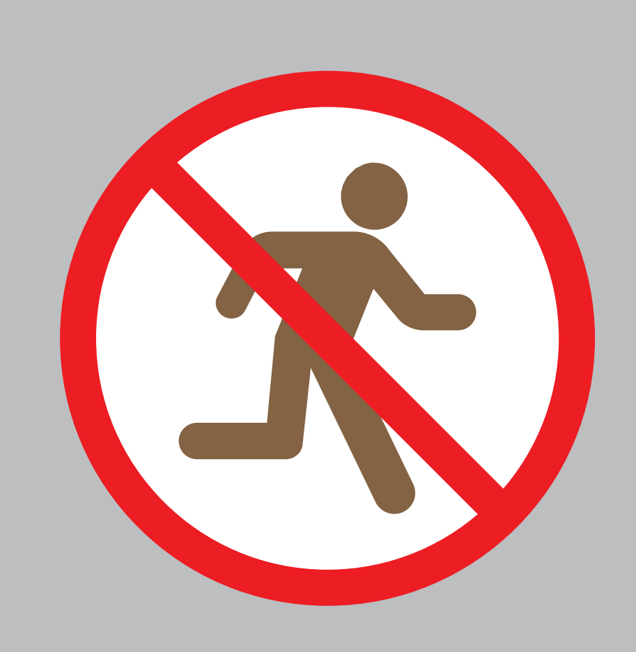
No Running 请勿推撞追逐