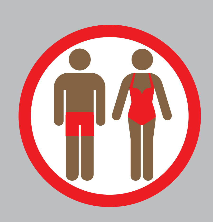
Proper Swimming Attire 必须穿上合适泳装