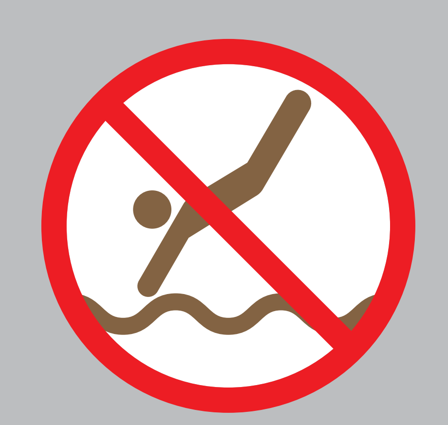
No Diving 请勿跳水