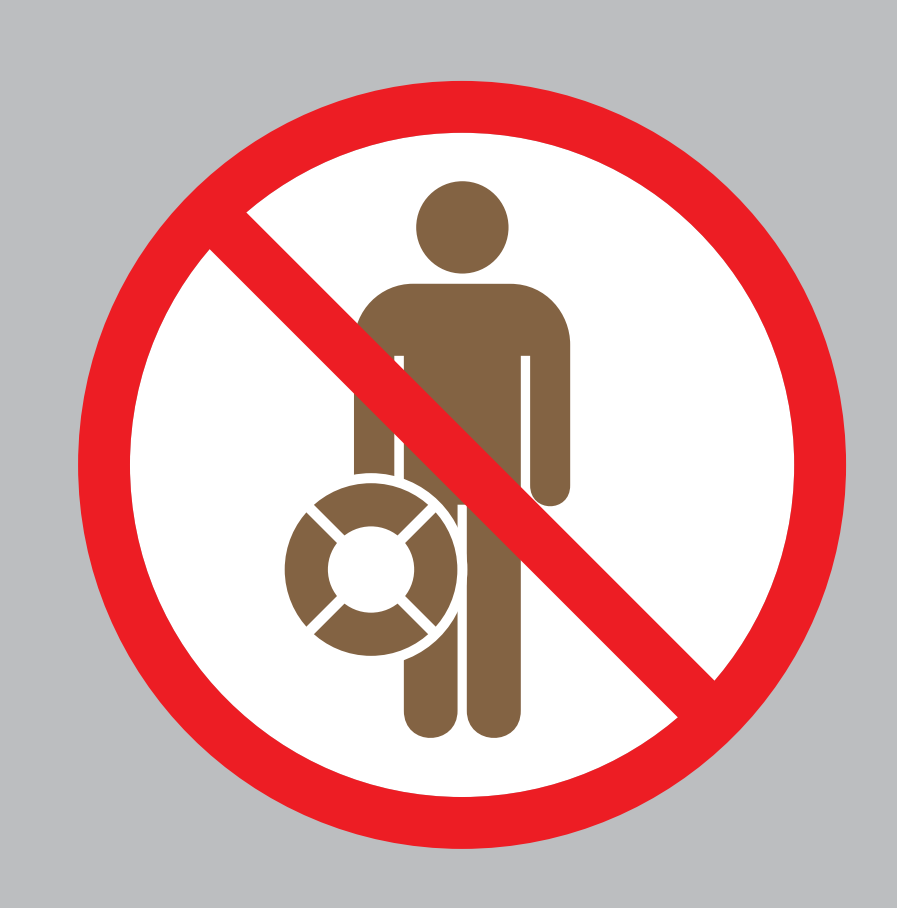
No Life Guard on duty 无救生员值班