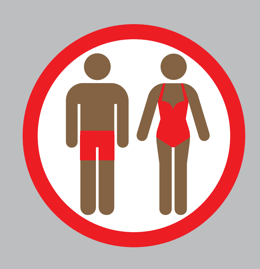
Proper Swimming Attire 必须穿上合适泳装