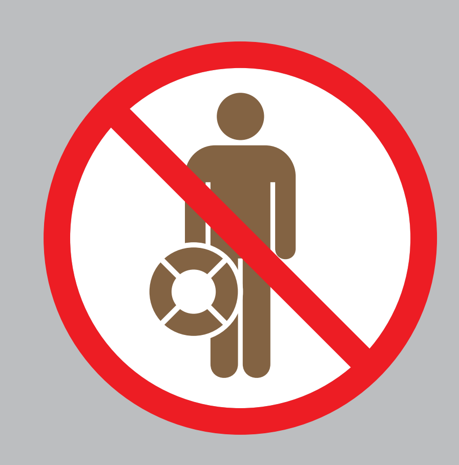
No Life Guard on duty 无救生员值班