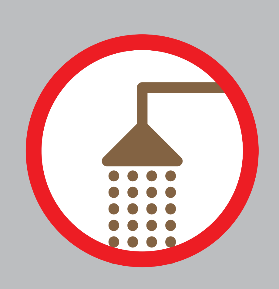
Shower before and after entering the pool 下水前后必須淋身濯足